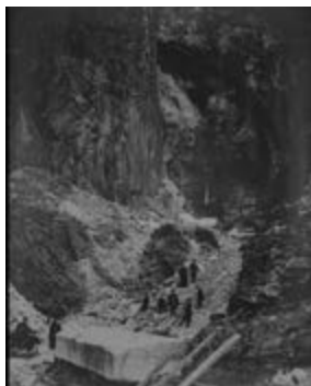
COEM_Veneranda_Milano Sublime_img_5.jpg 1902 View of the Candoglia Quarry.