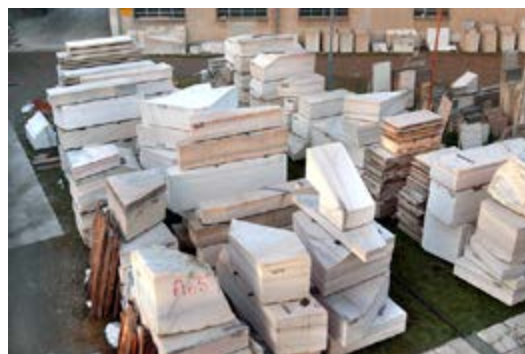
COEM_Veneranda_Milano Sublime_img_4.jpg 2005 Marble blocks in the courtyard of the Cantiere Marmisti.