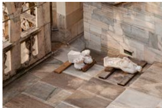
COEM_Veneranda_Milano Sublime_img_2.jpg 2020 Sculptures yet to be placed on the Cathedral.