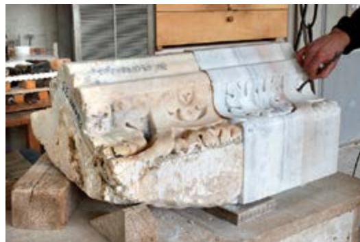
COEM_Veneranda_Milano Sublime_img_6.jpg 2005 Copying of a marble ornamental element at the Cantiere Marmisti.