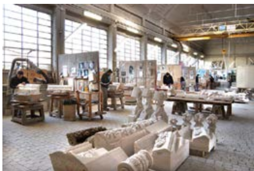
COEM_Veneranda_Milano Sublime_img_3.jpg 2005 View of the Cantiere Marmisti.