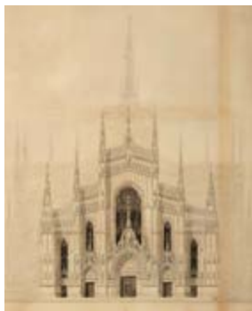
COEM_Veneranda_Milano Sublime_img_1.jpg 1888 Gaetano Moretti, Project for the new façade of Milan Cathedral.