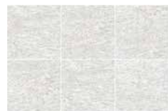
Mild random design (7)