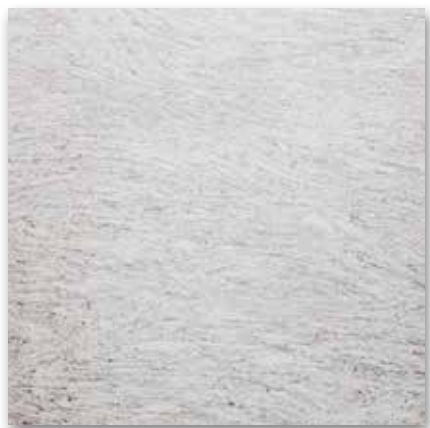
TGT605769CR dJuparana Grey