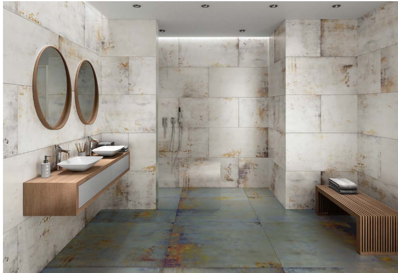
floor: Lamiere Blue Natural 100x100 walls: Lamiere White Natural 50x100